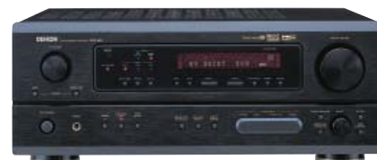
Front panel with terminal cover.

(*1) Note on Movie mode: On DENON A/V receivers, this Movie mode is displayed as "MODE CINEMA".