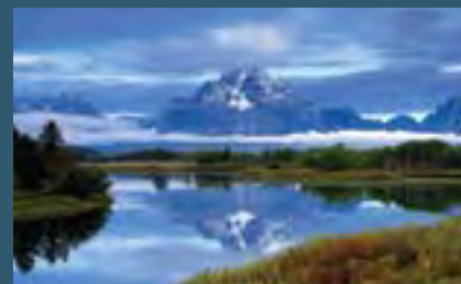
NO MAGNIFICATION (picture taken with typical digital camera)

Why use a Bushnell ImageView? The lenses on typical digital cameras simply do not provide enough magnification to deliver a real close-up view of distant subjects. Blowing up the image (cropping and enlarging) using computer software simulates a more powerful lens, but with a great reduction in quality. Our ImageView Digital Imaging Binoculars capture the image through their 8x camera optics. This means your photo subjects will actually appear eight times closer (not possible with a "3x" or "5x" zoom camera lens), and will be much sharper than what you get by trying to "blow up" part of the photo from a regular digital camera. The comparison (right) shows the dramatic difference.