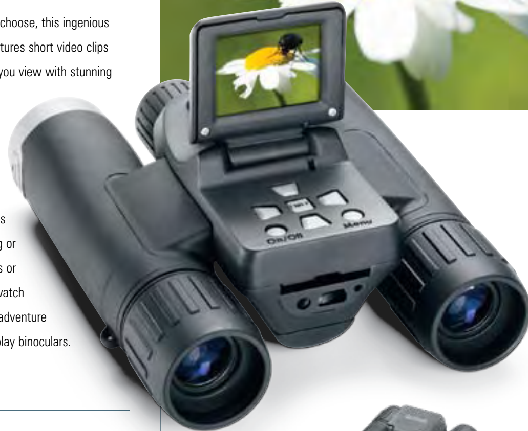
8x 30mm 118326