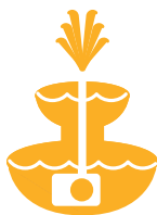
Medium Fountains Up to 3 ft high