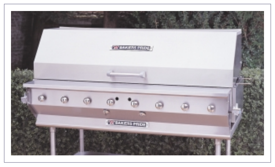
Model CBBQ-60 — with optional 60" roll-top hood

The Ultimate Outdoor Char Broilers are designed for broiling, grilling, steaming, roasting and holding — all in a single piece of equipment.