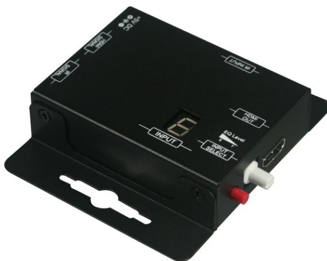
Model #: HDMI-C5SW-R

HD ready 1080p HDMI HDCP 7.1CH Audio TRUEHD