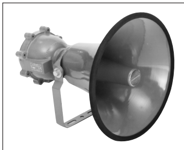
HLE-1 Driver mounted to HLE/MLE-32 Horn (order separately)