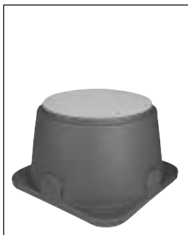
ATS100GL(8) landscape base shown with included yellow "under construction" base opening protector