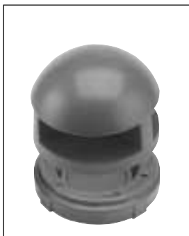
ATS183GS(8) surface mount base and speaker/transformer unit