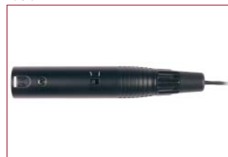
XLR connector with integrated bass cut filter