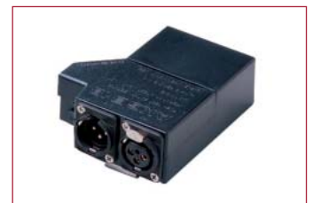
Optional B 18 battery power supply