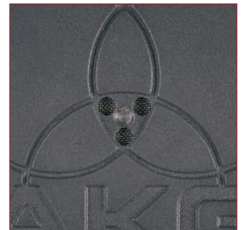
Sound entry ports on C 542 BL top