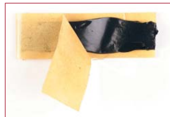
Adhesive compound for easy installation