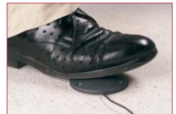
Extremely rugged construction