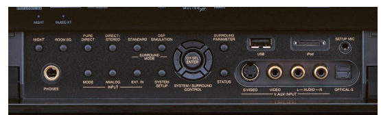
Inside of the trapdoor