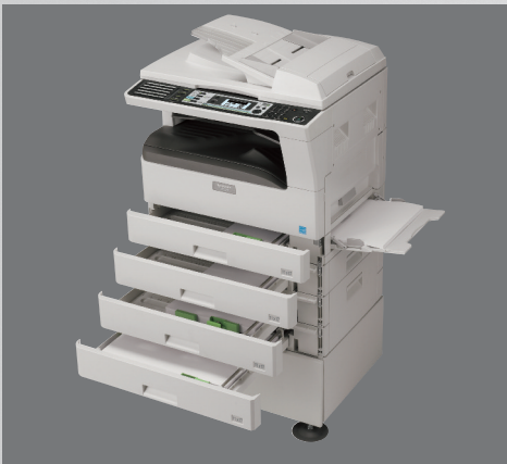
MX-M232D shown with optional 2 x 500-sheet paper feed unit.