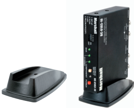
V-CB1 Desktop Stand