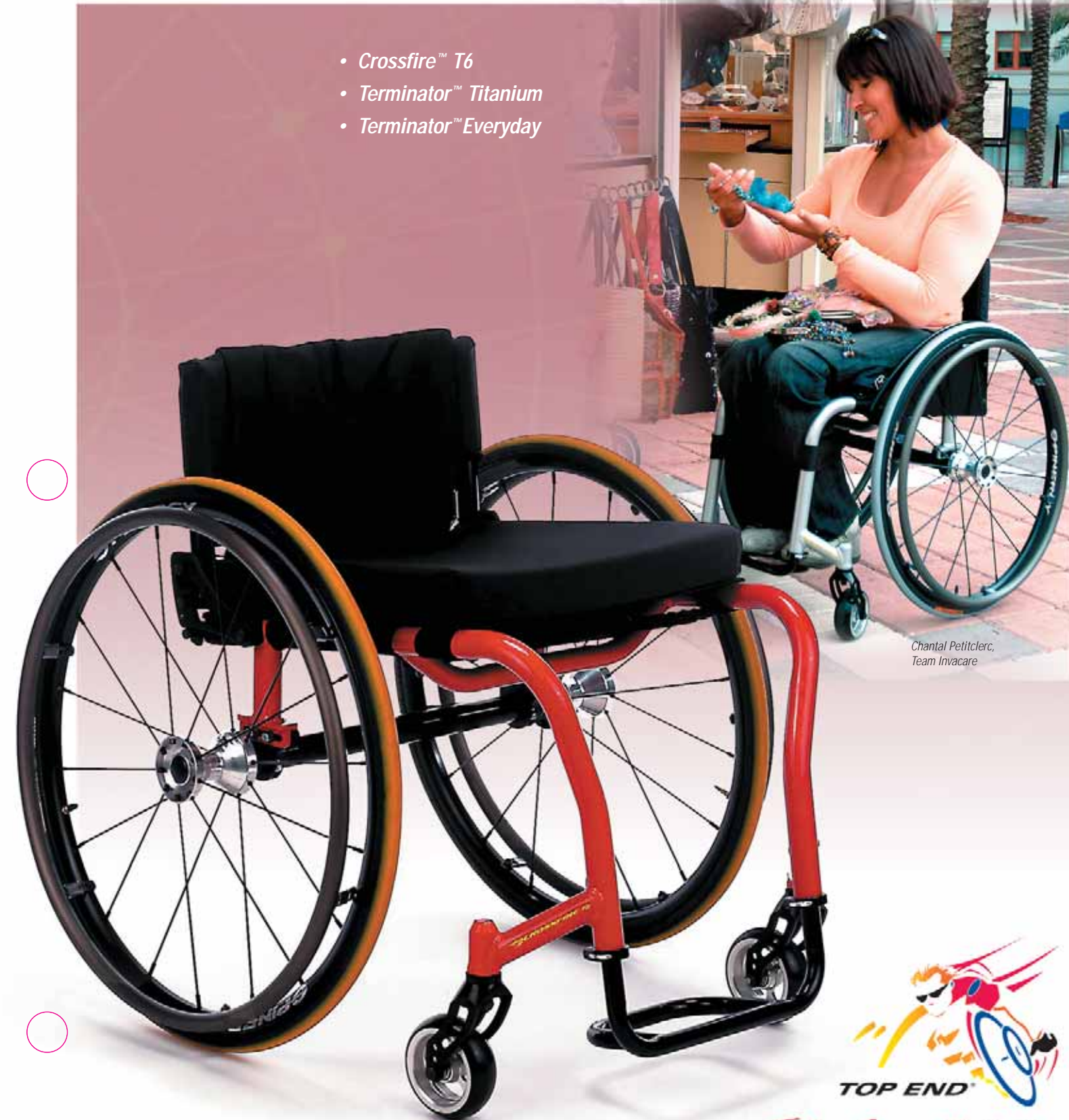
Chantal Petitclerc, Team Invacare