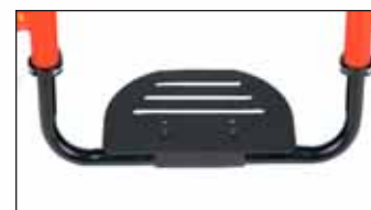
Redesigned adjustable angle footplate is lighter and lets you find the perfect foot position.