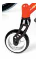
Forks feature inset bearings for smoother turning plus your fork stem caps will never fall off again.