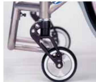
Frog Legs® suspension forks.