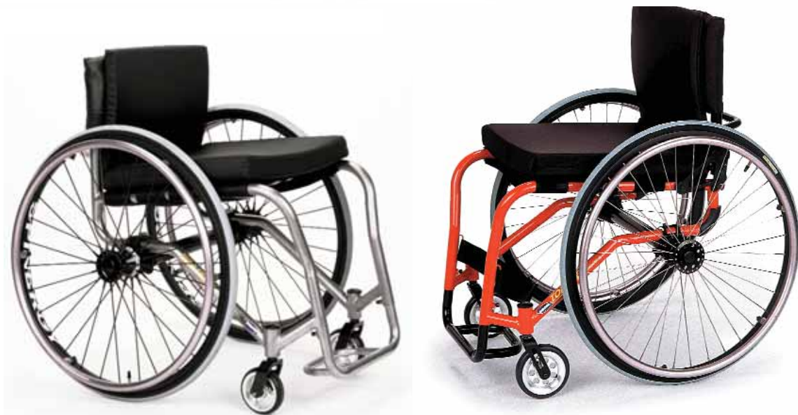
Invacare® Top End® Terminator™ Titanium shown with optional Spinerge® rear wheels.

The Invacare® Top End® Terminator™ Titanium and Terminator™ Everyday are full frame designed chairs and are perfect for extremely active or rugged lifestyles. If you want a super customized chair without all the custom upcharges or if you want the option of rear suspension, these are the chairs for you. The new ergonomic seat option is something you definitely want to check out. For more details see page 3, as all of the same great benefits also apply to the Terminator. If you need a heavy-duty option you won't have to sacrifice either - the Terminator Series combines great design with the strongest and lightest materials to give you a super chair that fits perfectly and delivers everyday performance. Built for you - exactly the way you want it.