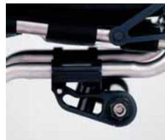
Rear suspension system features a dual uni-pivot polymer unit. Adds less than one pound of weight.