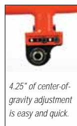
4.25" of center-of-gravity adjustment is easy and quick.

But that is not all. The Crossfire T6 has many custom frame options such as the tapered seat width option, which allows the front of the seat to be narrower like your body, virtually making the chair disappear. Then there is the ergonomic seat option, which offers improved posture, pressure distribution and propulsion by building a level "sweet spot" into the frame for your pelvis to sit on.