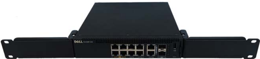
Figure 1-1. Dell Rack Mount Kit