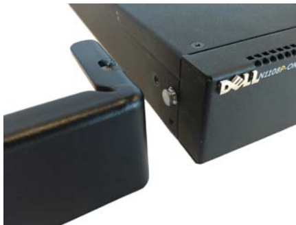
Figure 1-3. Attaching the Brackets